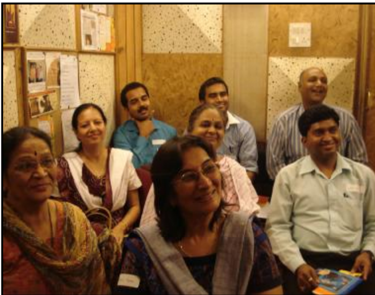
Participants of Presentation skills workshop : 23rd May'08 Co. Forever Living Products & All Wave A –V Systems Pvt.Ltd.